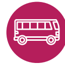
Trips on the Memory Maker minibus