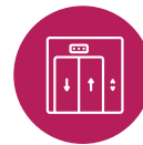
Lift to each floor