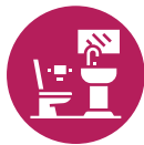
Ensuite facilities in some rooms