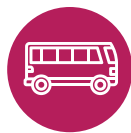
Trips on the Memory Maker minibus