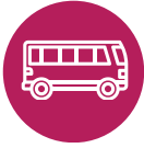
Trips on the Memory Maker minibus