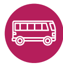
Trips on the Memory Maker minibus