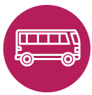
Trips on the Memory Maker minibus