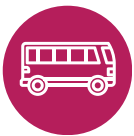
Trips on the Memory Maker minibus