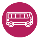
Trips on the Memory Maker minibus