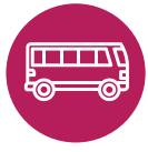
Trips on the Memory Maker minibus