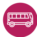
Memory Maker minibus