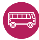
Memory Maker minibus