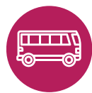
Memory Maker minibus