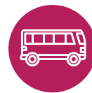
Memory Maker minibus