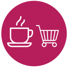
Cafe and shop