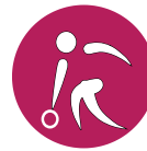
Rooftop bowling green