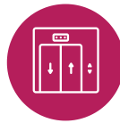
Lift to each floor