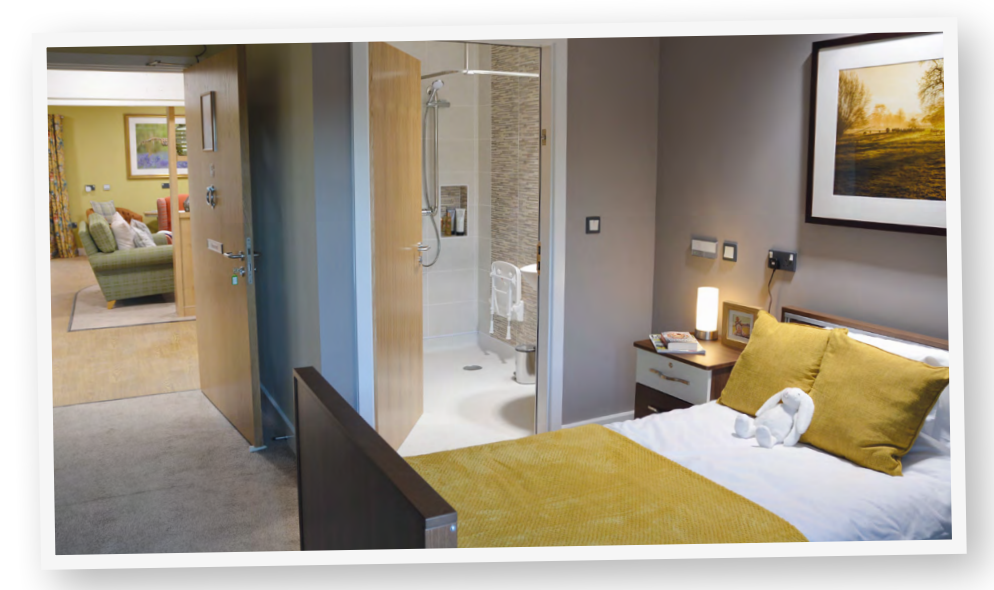
Above: A typical ensuite bedroom at Woodside Care Village...

There's a table tennis table and there are fantastic acoustics in this space, which would be great for performances – something to watch out for during Music for Dementia 2020, as we look to make music even more accessible at Woodside Care Village.