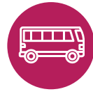
Memory Maker minibus